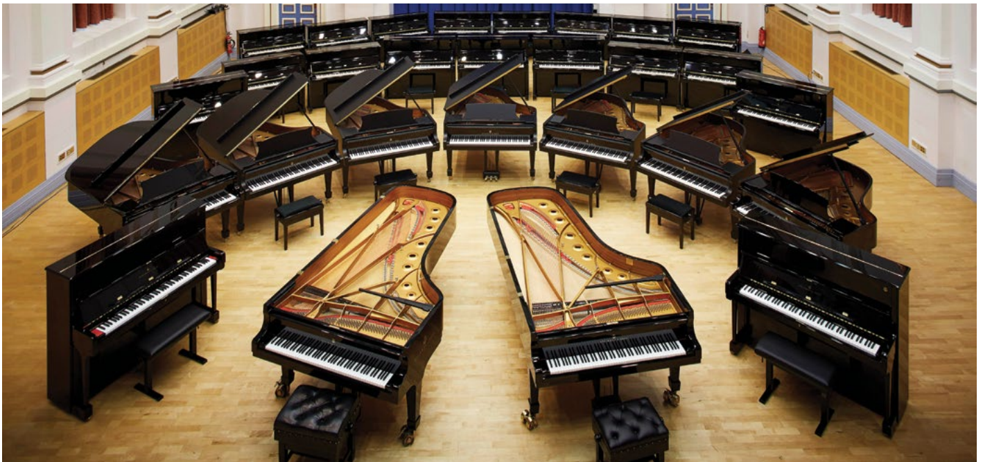
Clothworker's Centenary Concert Hall.

majority of the pianos are new Steinways. It is highly befitting that the University of Leeds is now one of the elite few, not only enabling musicians to reach their full potential, but also enriching the experience of every student with a passion for music."