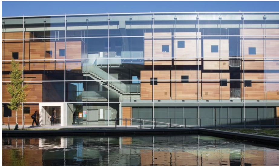
Overlooking a tranquil reflecting pool, the new musical addition is part of the Arts and Transit Neighborhood on the southern tip of the campus.