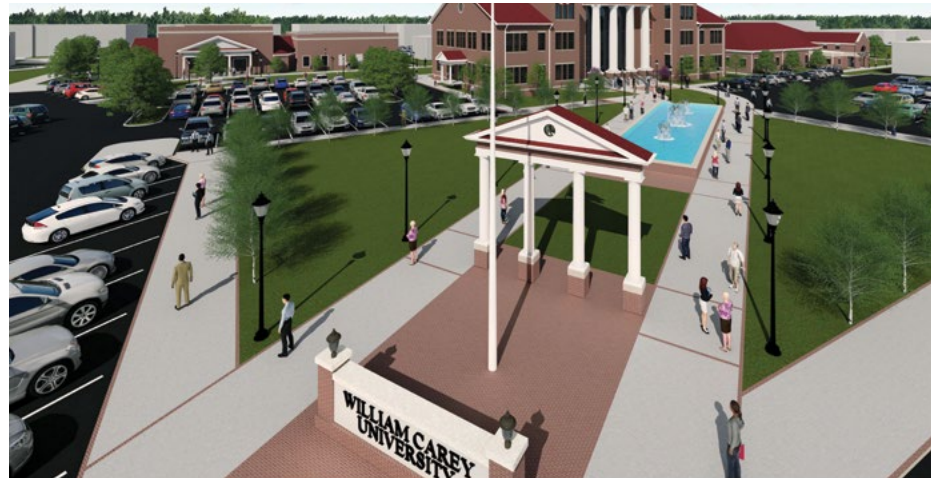
Architect's rendering of new entranceway planned at WCU.