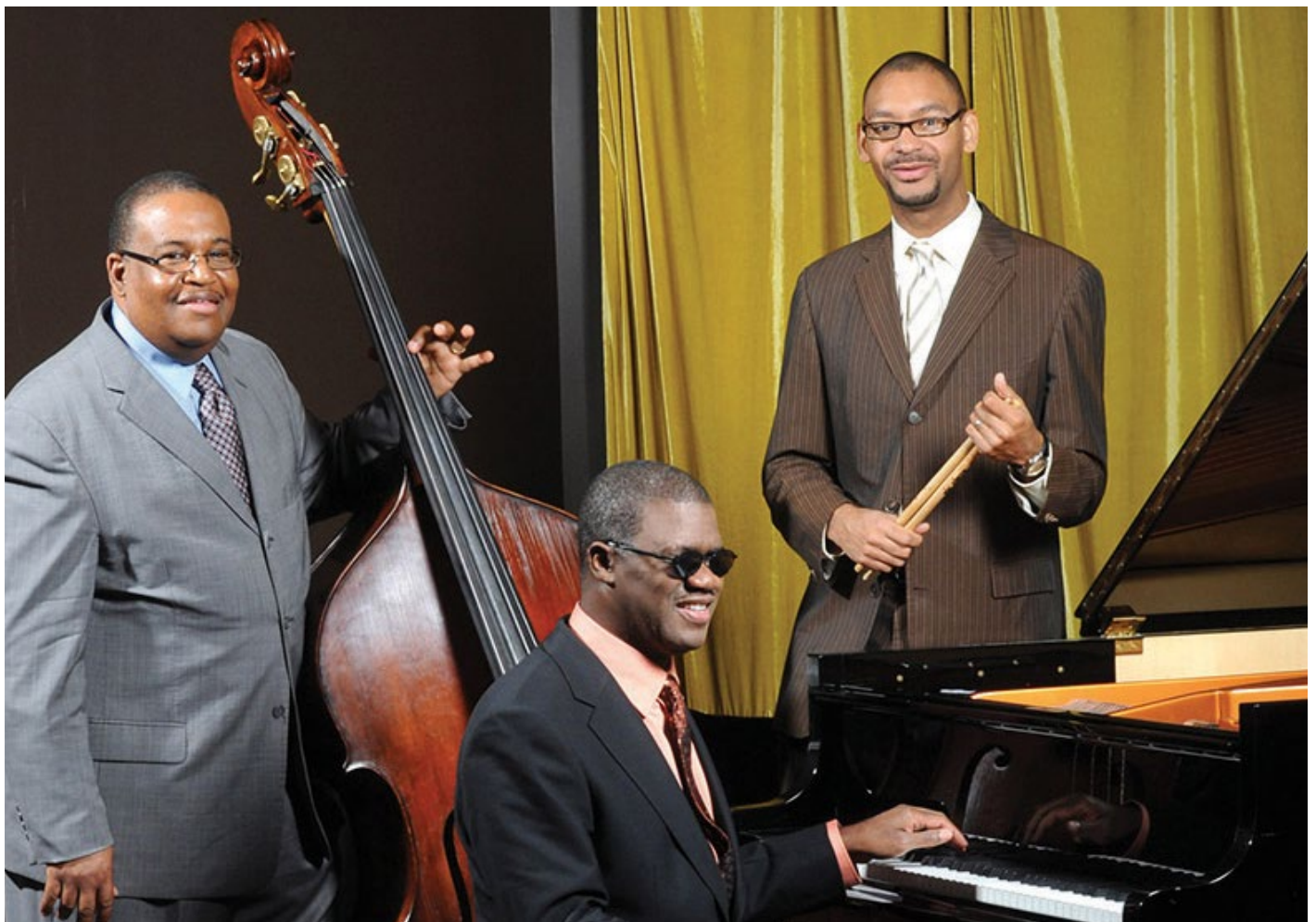
The Marcus Roberts Trio performed at Huston Tillotson's All-Steinway celebration.