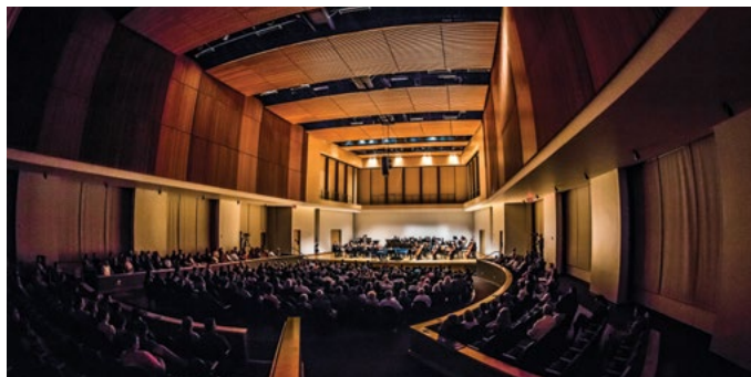
The Dr. Bobbie Bailey & Family Performance Center at Kennesaw State University.

like beautiful pieces of art," she said, referring to two Model D concert grands on stage at the school's rehearsal hall.