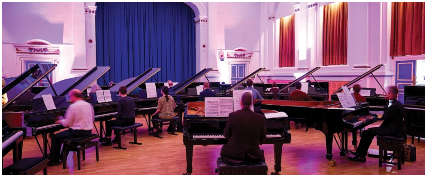
Twenty seven pianists perform a special composition to celebrate the All-Steinway designation.

LEEDS, WEST YORKSHIRE – For the first time in its illustrious 55-year history, the Leeds International Piano Competition will be hosted by an All-Steinway School.