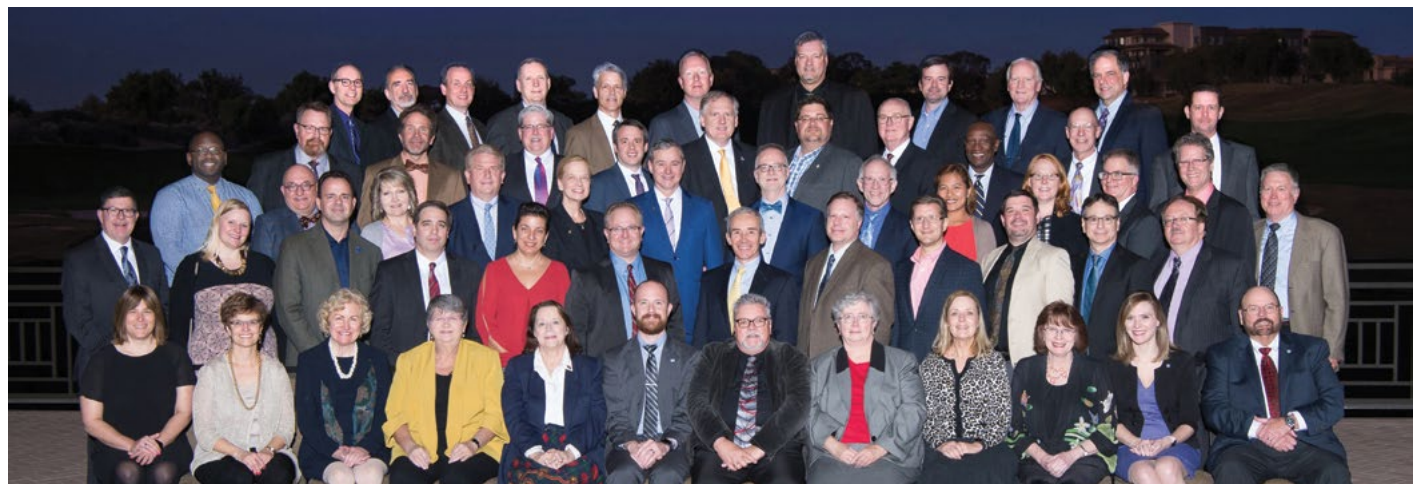
Steinway & Sons welcomes academic leaders from more than 50 institutions to the All-Steinway reception at the 2017 National Association of Schools of Music annual meeting at the Westin-Kierland Resort in Scottsdale, Arizona.

School personnel met with representatives of Jacobs Music Company in Philadelphia