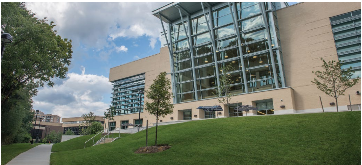
The Center for Design, Media and the Arts.

Established in 1964 as the Northern Virginia Technical College, NOVA today has nearly 80,000 students and more than 2,500 faculty and staff members at six campuses and four learning centers, according to its website. It is also one of the most internationally diverse colleges in the United States, with a student body consisting of individuals from more than 180 countries.