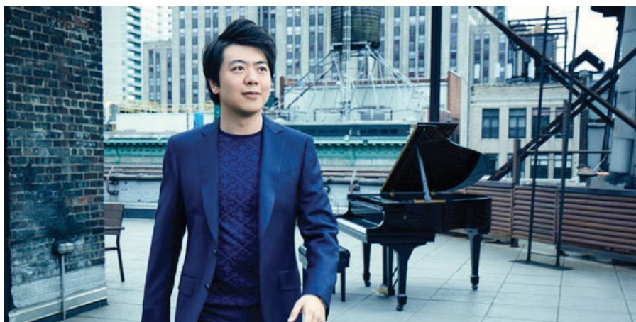
Lang Lang.