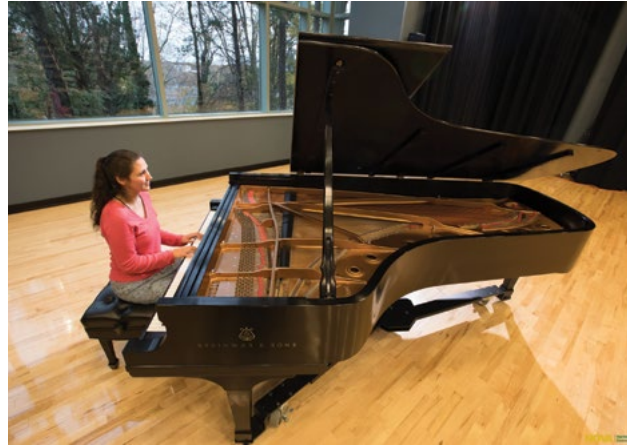
A Model D Concert Grand fills the recital space.