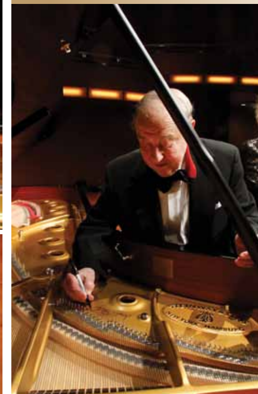
Menahem Pressler autographs one of the new Steinway Model D concert grand pianos at James Madison University.