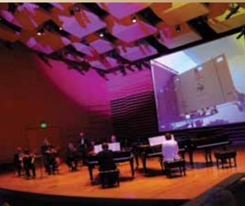
The official Steinway Celebration on stage at the new USF music building.