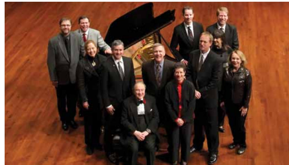
Dignitaries from Steinway & Sons, James Madison University and the Steinway Piano Gallery of Washington D.C. celebrate together.