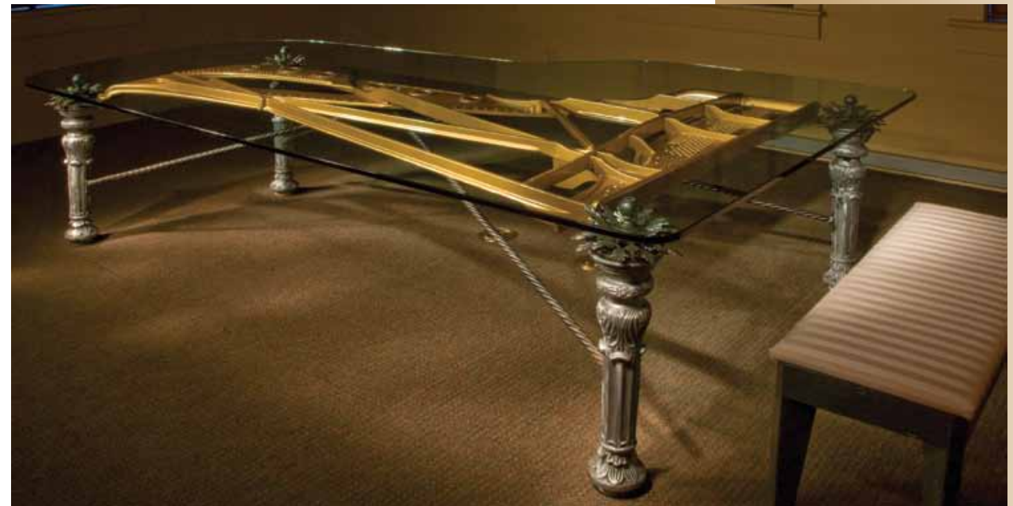
The frame of the storm-damaged Steinway grand was given a second life as the Opera House's conference table ... complete with keyboard-themed fabric on the conference table's benches.

GALVESTON, TX – Steinway pianos have a well-deserved penchant for nurturing lifelong relationships with their owners. And the bond becomes so strong in some cases that it demands a creative alternative when letting go just isn't an option.