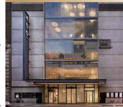
Orchestra of St. Luke’s and Steinway – A perfect combination.