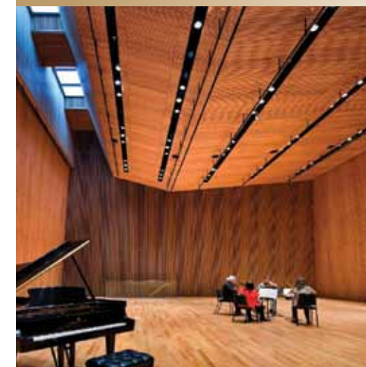
Chamber Orchestra on stage at The DiMenna Center for Classical Music.

More than five years in the making, The DiMenna Center was conceived to provide a haven for the many freelance musicians of New York. And like the amalgam of talent that will be drawn under one roof, the Center represents a collaboration among different, but like-minded supporters ranging from the City of New York to various foundations and private donors.